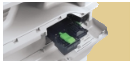
toner Save function to reduce consumption without sacrificing quality