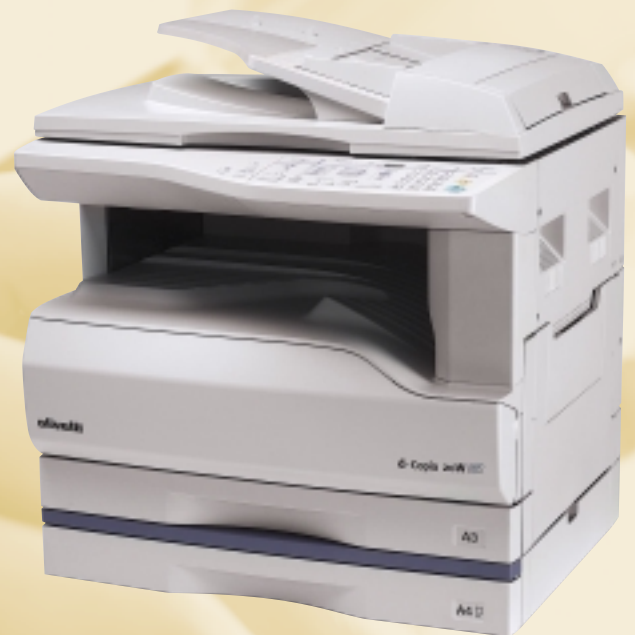
Olivetti d-Copia 20W b/w digital copier with a speed of 20 cpm