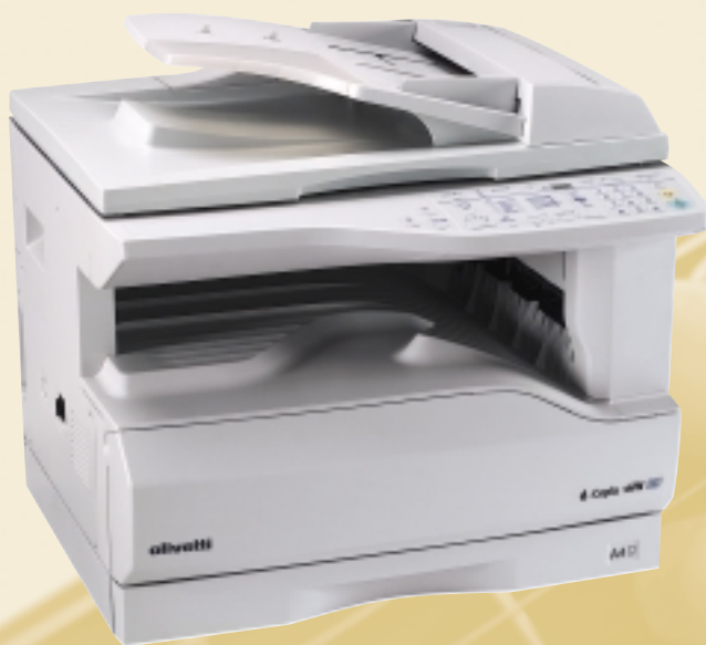
Olivetti d-Copia 16W b/w digital copier with a speed of 16 cpm

Capacity of up to 600 sheets (d-Copia 20W) for increased productivity